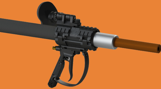
BAABS Short Rail Assembly w/ Pneumatic G3 Trigger Deadman & Adjustable Brace