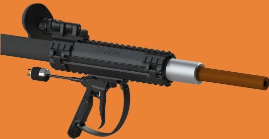
BAABS Long Rail Assembly w/ Electric G3 Trigger Deadman & Adjustable Brace