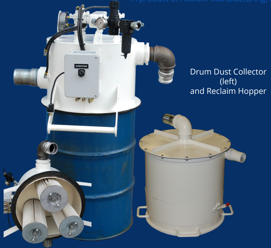
Drum Dust Collector (left) and Reclaim Hopper

The Schmidt® Modular Drum Reclaim System is a convenient and portable solution used to move small or large volumes of abrasive for either recycling or removal. The system's drum dust collector easily separates dust and debris from usable "good" abrasive more efficiently than manual sieves and is significantly less fatiguing for operators. Adaptable to any existing stationary or portable blasting operation, the Modular Vacuum Reclaim System improves production and minimizes downtime in your application. Available as a full system or individual components.