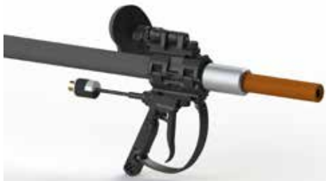
Sub-Compact BAABS Assembly w/ Electric G3 Trigger Deadman

L=7.125" x W=3.03" x H=3.47" Weight = .75 lbs.