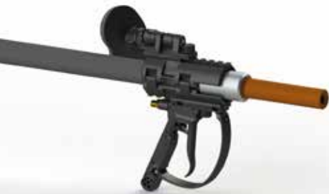
Compact BAABS Assembly w/ Pneumatic G3 Trigger Deadman